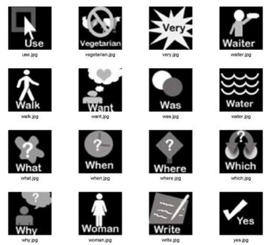
Figure 2. Sample pictograph images from game

For each of the 200 words a pictograph was designed. The design of these pictographs was informed by research in symbolic language conducted by the American Institute of Graphic Designers [13] and Western conventional pictographs. 150 original pictographs were designed and implemented for the Mandarin Chinese version of Polyglot Cubed. Figure 3 illustrates a few of these original pictographs.