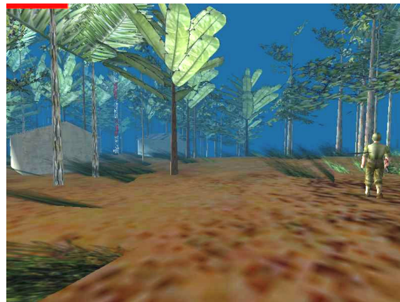
Figure 1. Screenshot of the Third World Shooter game.

Third World Shooter (see figure 1) began with several fairly lofty design goals. The history of the War of Independence is full of complex politics that could find analogy to the stalemates of the contemporary war on terror. The people seeking independence from the Portuguese colonial system were considered enemies of the state. To gain independence, the African Party for the Independence of Guinea and Cape Verde (PAIGC) used propaganda, sabotage and military action. As a Marxist group, funding and support for the liberating PAIGC often came from communist China and the then USSR. Despite the country's cold-war era allies, Cape Verde in particular has a very strong relationship with the United States.